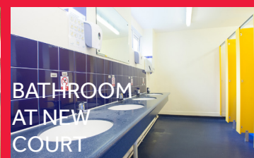
BATHROOM AT NEW COURT