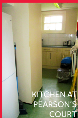
KITCHEN AT PEARSON'S COURT