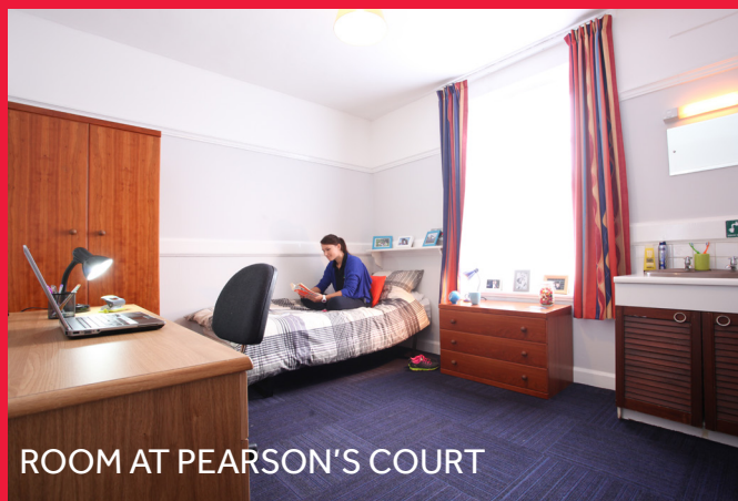
ROOM AT PEARSON'S COURT