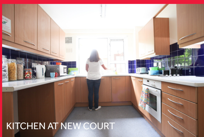
KITCHEN AT NEW COURT