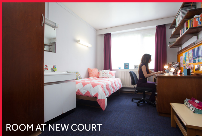
ROOM AT NEW COURT