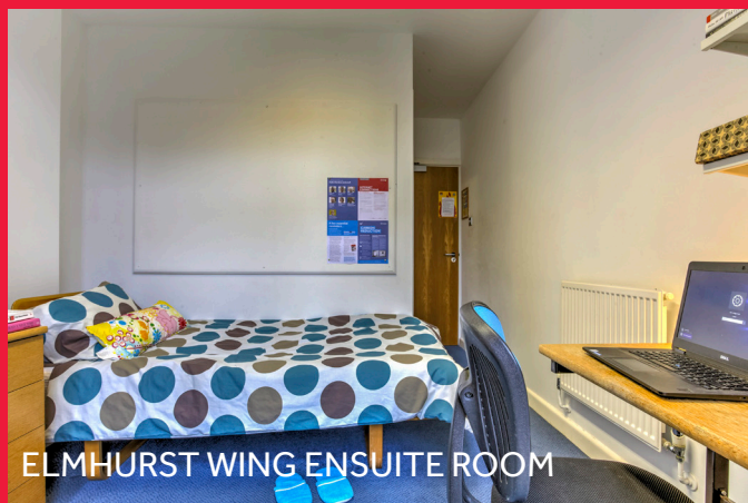
ELMHURST WING ENSUITE ROOM