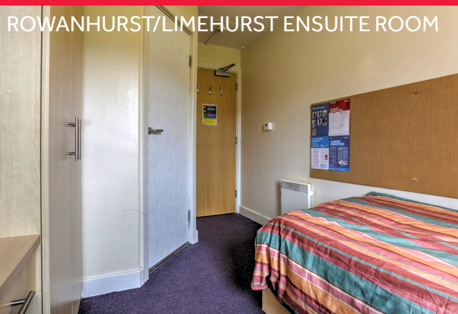
ROWANHURST/LIMEHURST ENSUITE ROOM