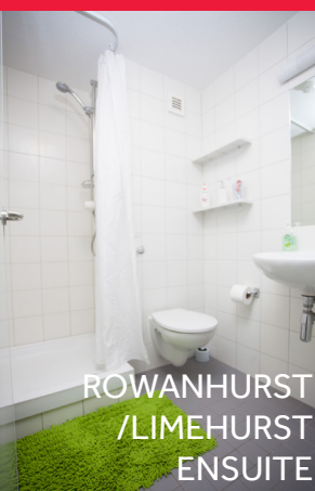
ROWANHURST /LIMEHURST ENSUITE