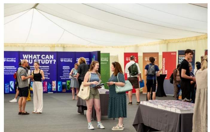
Inside the marquee