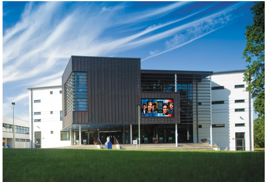
Carrington Building (close to the marquee)