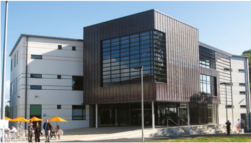
The Carrington Building with our quiet room is just past the marquee, and close to the Blue Badge parking area.

We also have a prayer room in the Student Union (the Board Room)