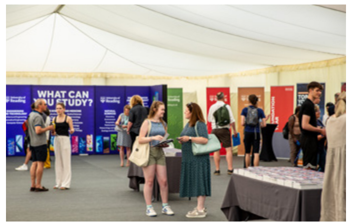
Inside the marquee